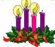
Advent Candles Sale

ADVENT CANDLES will be available for purchase the weekend of December 2 nd & 3 rd after all the Masses in the Narthex. Candles are 10” tapers and are available for $8.00 a set.