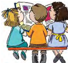
Share God’s Word

“Come, children, listen to me: I will teach you of the Lord.” Psalm 34:12 It is a blessing to be able to share your faith with children or youth who are just beginning their faith journey! BE A CATECHIST AND MAKE A DIFFERENCE IN THE LIFE OF A CHILD OR TEEN!